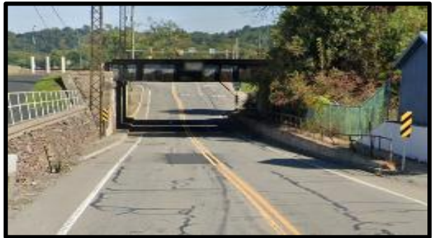
Top left photo: MPMS 85290 location Top right photo: MPMS 11352 location Bottom right photo: MPMS 121840 location Bottom left photo: MPMS 82774 location