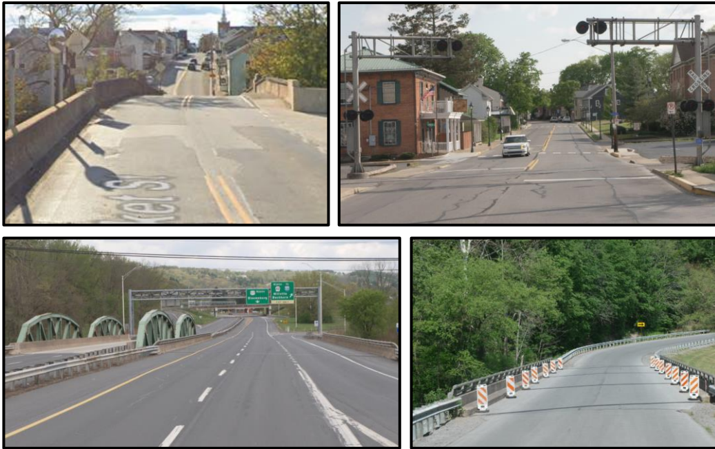
Top left photo: MPMS 4190 location Top right photo: MPMS 119246 location Bottom right photo: MPMS 114302 location Bottom left photo: MPMS 118769 location