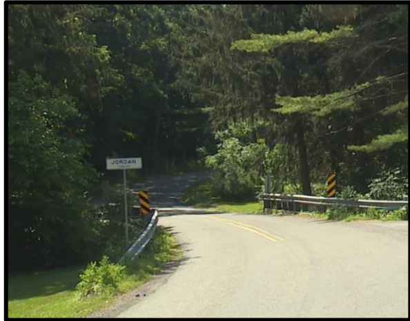
Top left photo: MPMS 117576 location Top right photo: MPMS 98610 location Bottom right photo: MPMS 114142 location Bottom left photo: MPMS 105566 location