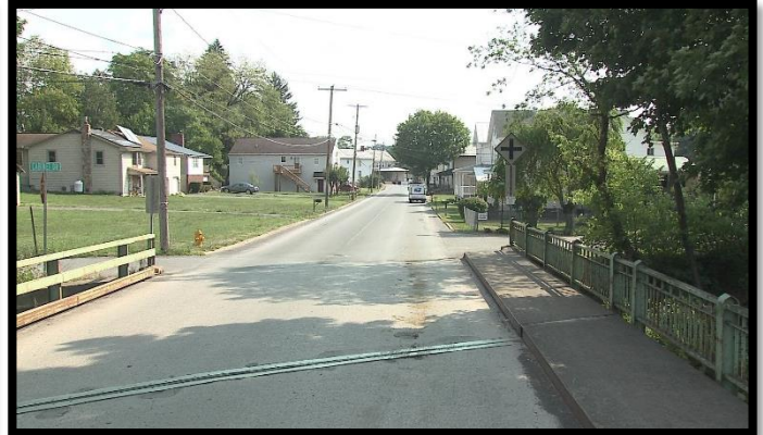
Top left photo: MPMS 114972 location Top right photo: MPMS 117901 location Bottom right photo: MPMS 4616 location Bottom left photo: MPMS 91608 location