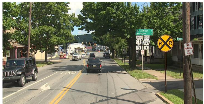
Left photo: MPMS 112195 location Top right photo: MPMS 110354 location Bottom right photo: MPMS 94702 location