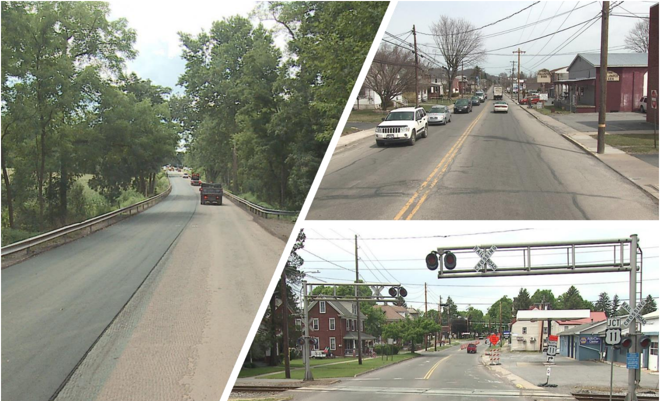
Left photo: MPMS 91431 location Top right photo: MPMS 101897 location Bottom right photo: MPMS 111351 location